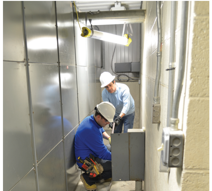
LuxCommander® Portable Work Lights are ideal for temporary lighting in confined spaces.

LuxCommander® Portable Work Lights come in fluorescent or LED lamp variants. A retrofit kit allows you to update your LuxCommander® to support either lamp type. Whether your application requires the maximum amount of luminance or increased lifetime and lower power draw, the choice is up to you.