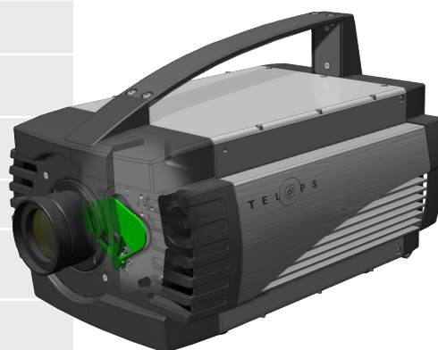
The automated 3-position filter mechanism.