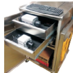
Optional double drawers